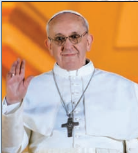
His Holiness POPE FRANCIS Jorge Mario Bergoglio

Comcast 268 (183 in some areas) Verizon FiOS 296 Charter 101 • RCN 85 Roku, GoogleTV • CatholicTV.com