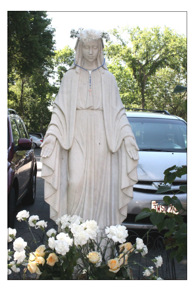
The statue of Our Lady in the parish gardens. The children of the Iraqi Catholic community had a crowning ceremony for Our Lady at their Mass last Sunday, June 1st.

The Syriac-rite Liturgy is in Aramaic and Arabic. All are welcome to attend. Booklets with English translation are provided.