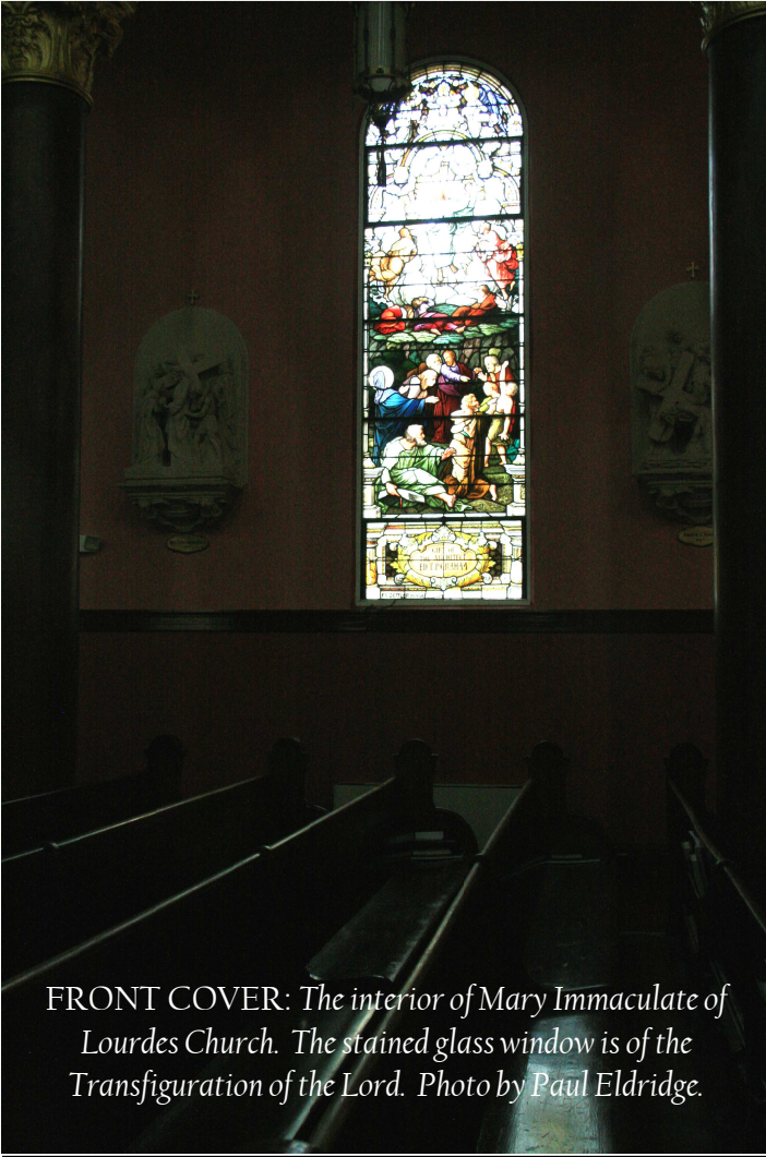
FRONT COVER: The interior of Mary Immaculate of Lourdes Church. The stained glass window is of the Transfiguration of the Lord.