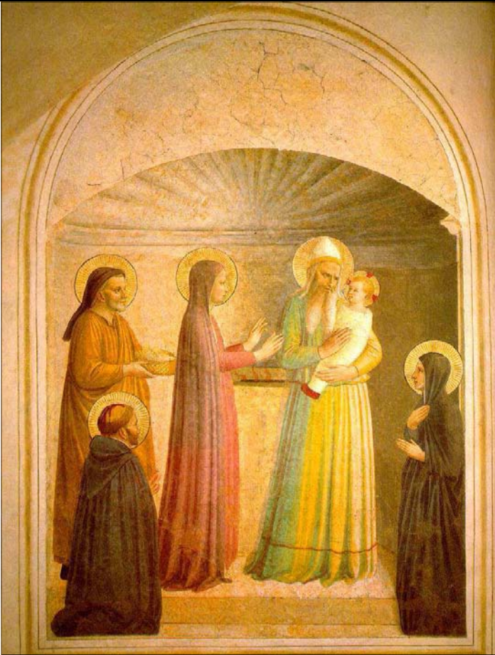
FRONT COVER: Fra Angelico's "Presentation of the Lord".