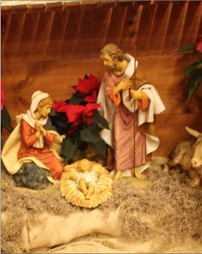
FRONT COVER: The Christmas Crib inside our parish church for this year 2014-2015.