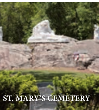
ST. MARY'S CEMETERY

St Mary's Cemetery in Needham, founded in the 1870's, is the parish cemetery of Mary Immaculate of Lourdes. The Cemetery is a reverent resting place for those awaiting reunion with the Risen Lord. The decision to pre-plan and purchase interment rights is a responsible and thoughtful gesture, sparing loved ones the stress of making difficult decisions during a time of grief and loss.