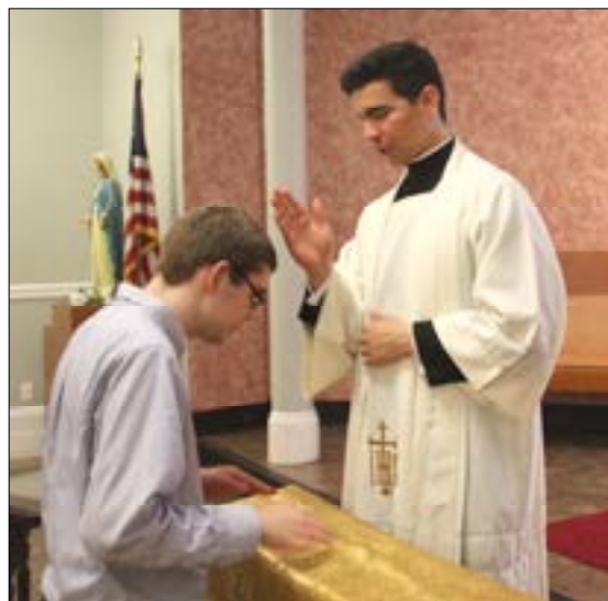
The Priestly First Blessing.