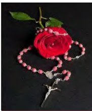
ST. MARY'S CEMETERY

841 Main Street Tewksbury, MA 01876 (978) 851-9103